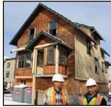
Heritage home renovated by Avalonna Homes.