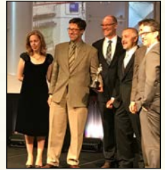
LWE Builders for Best Certified Home – Custom

As an industry that continues to progress, there was an increase in submissions this year, seeing many inspirational and high calibre projects submitted. Built Green Canada would like to congratulate all finalists and award winners. And, a special shout out to Portrait Homes Ltd, winner of Best Environmental Initiative; RDC Fine Homes Inc. for Best Certified Home – Production; and LWE Builders for Best Certified Home – Custom.