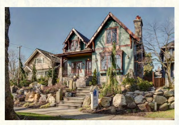
Builder Member: Check out RJR Construction Management Ltd.'s BUILT GREEN® project.