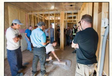
Photo from workshop

The workshop saw close to 50 industry members in attendance—builders, energy advisors, consultants, manufacturers, and municipality representatives, which took place at a Jim Zsiros Contracting's build-in-progress slated to achieve BUILT GREEN® Platinum certification. The workshop was worth 2 Continuing Professional Development points through BC Housing and 2 Continuous Professional Learning units through the Planning Institute of British Columbia.