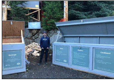
on-site at a project by BUILT GREEN® member, Adisa Homes Ltd.

Did you know that environmentally friendly practices can contribute to your bottom line? Waste diversion can reduce disposal costs by up to 30 percent.