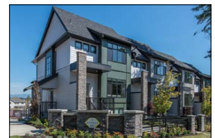
Photo of Evoque project

As building code continues to ramp up, some builders face the more stringent regulations with confidence. In the case of Maskeen Group of Companies , their enthusiasm for innovative technologies and their participation in a third-party home certification program have guided them beyond energy efficiency requirements.